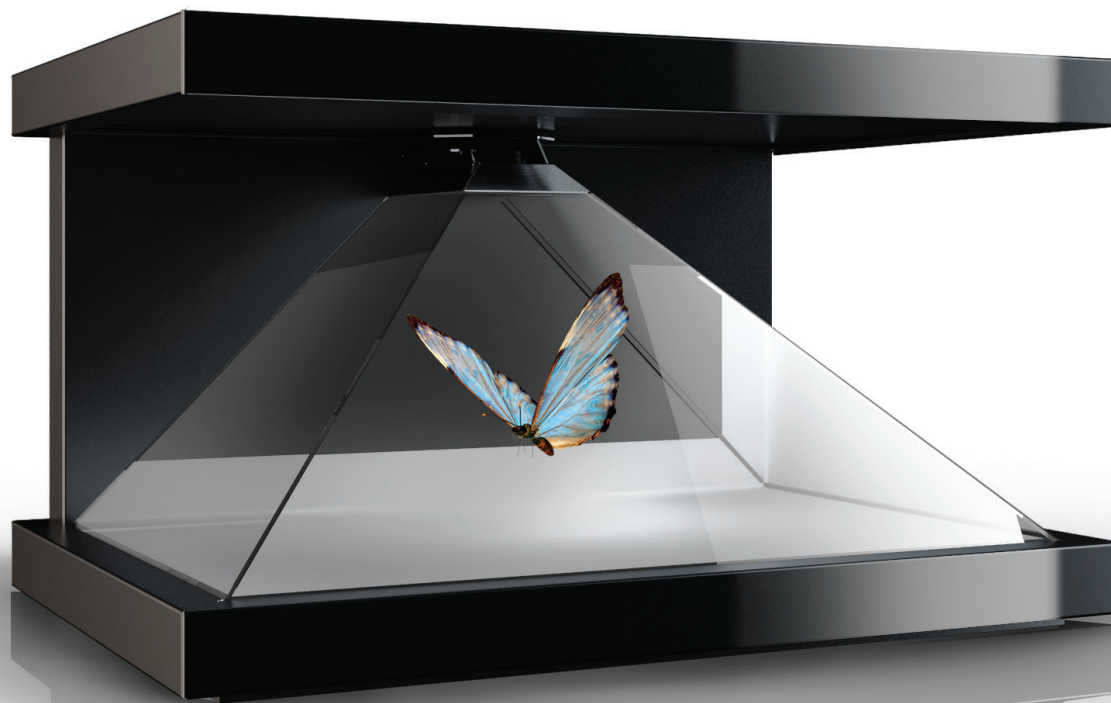
DREAMOC HD3 STAND DIMENSIONS FOR DESIGNING MAGNETIC SKIN VERSION 1.0