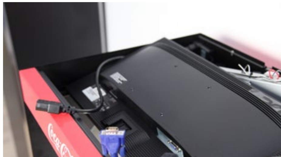
Remove the cables - VGA and power.