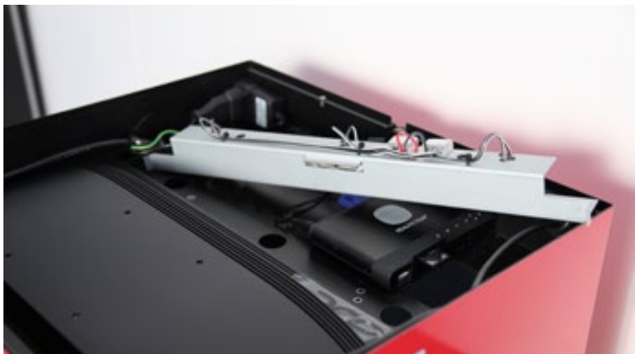
Lift the light bar and place it like this.