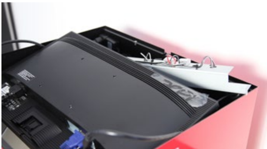
Pull the screen up and backwards.