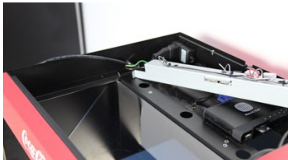
Remove the screen.